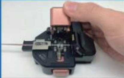
Operation by placing on your desk