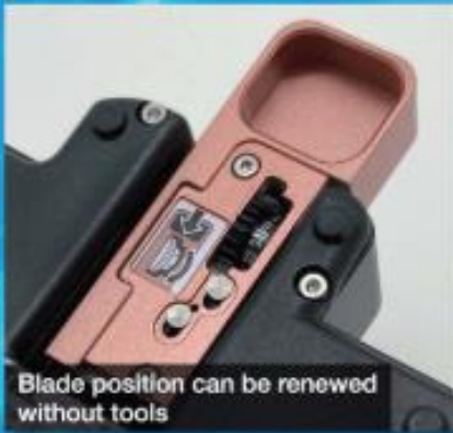
Blade position can be renewed without tools