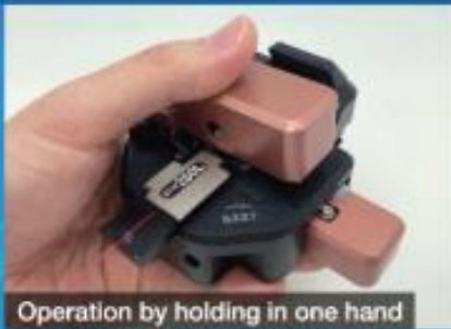
Operation by holding in one hand