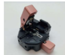
S327 Main Body

*4 If parts other than Blade, such as the Rubber pad, are worn out, replacing Blade alone may not restore the initial performance.