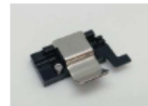
Single Fiber Adapter