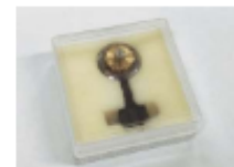
Blade Exchange Set (Optional component)